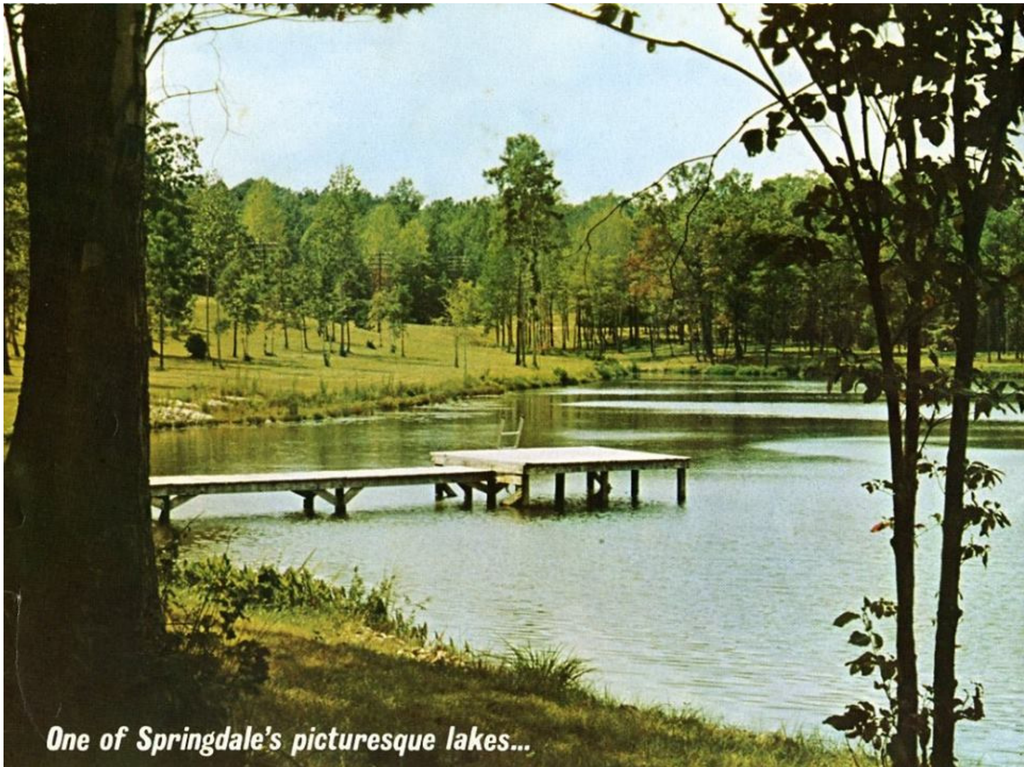
One of Springdale's picturesque lakes...