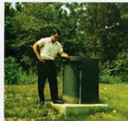
Far left is one of the water pumping stations for Springdale Estates.